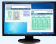
PC or Mac