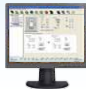
Net/X Command Center PC Software