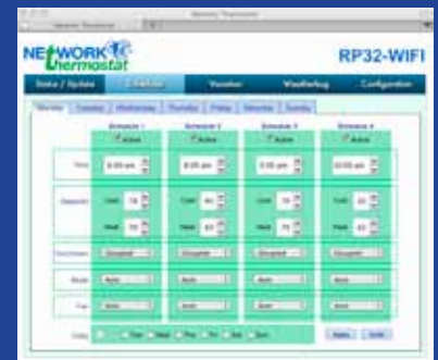
Simple Design for Intuitive Navigation