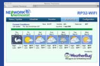
Quickly Make Adjustments Based on Your Needs